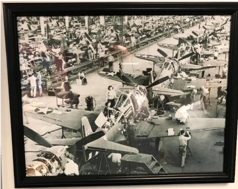
Picture to Left: The original use of the current DSW facility – building airplanes in WW2.